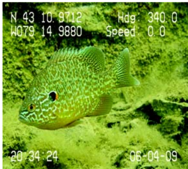
GPS and Text Overlay Option